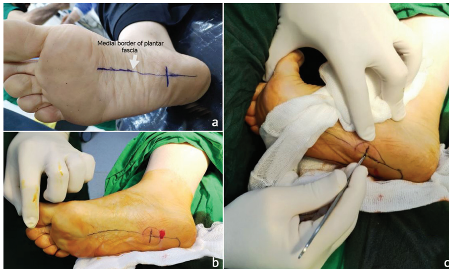
Fig. 1 The steps of mid sole percutaneous plantar fasciotomy: a – pre-operative marking; b – mark the site of local anaesthesia; c – site of percutaneous plantar fasciotomy