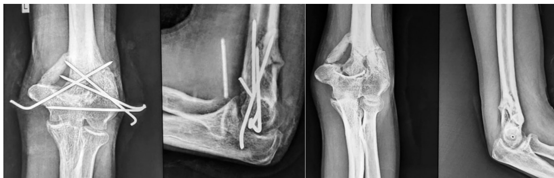
Fig. 2. Postoperative images at 3 months just before and after removal of K-wires

A total of 30 patients who satisfied the inclusion criteria were included, out of which 16 patients underwent ORIF and 14 patients underwent closed reduction and percutaneous pinning. The male and female patients which underwent surgery were also compared to observe sex distribution. It was not found to be statistically significant. The mean age and male to female ratio, and decade-wise distribution of patients is highlighted in Table 1.