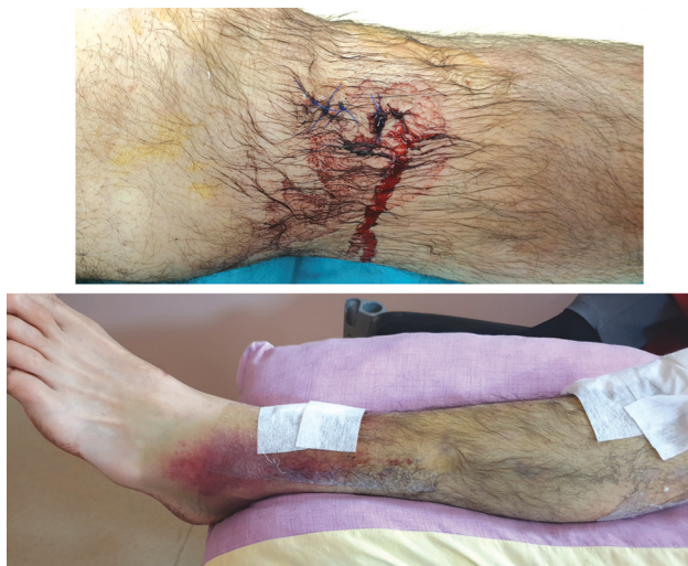
Fig. 11 71 year-old male with distal tibial fracture (AO/OTA 43A1), showing varicose veins

Group 5 A 71 year-old male with distal tibial fracture (AO/OTA 43A1) after being attacked by a dog was operated by tibial nailing. He had no history of bleeding diseases. The varicose veins of the broken leg were noted before the operation. Sixth hours after the operation, there was little bleeding seen as infiltration. The patient was brought to the operating room 24 hours after due to disturbing bleeding symptoms. Varicose veins were cauterized at the proximal screw level. At clinical follow-up examination, the patient had improved physical examination (Fig. 11).