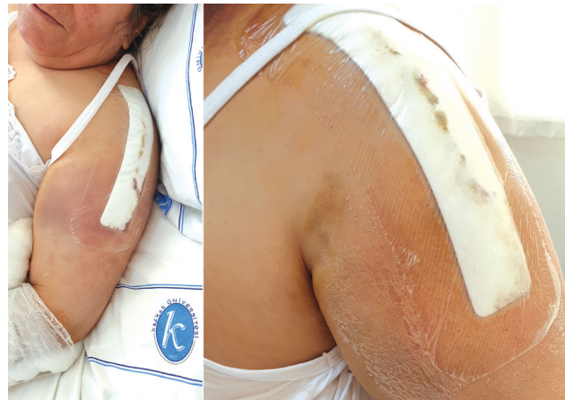
Fig. 10 Preoperative and postoperative ecchymosis, and subsiding swelling