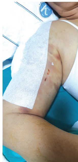
Fig. 12 60 year-old female patient with a proximal humeral fracture; infiltration bleeding (extensive ginger tea taken during a month prior to surgery)

Group 6 A 60 years-old female patient was referred to our trauma center with a proximal humeral fracture. The patient was operated using plate osteosynthesis and screws via a minimal invasive procedures. In the operation room, bleeding as infiltration was observed during all the operation time (Fig. 12). The patient was questioned for anticoagulation therapy. The patient and her daughter reported ginger tea drinking for a month.