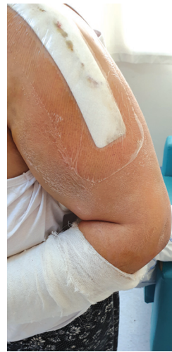
Fig. 8 Isolated thrombocytopenia at follow-up