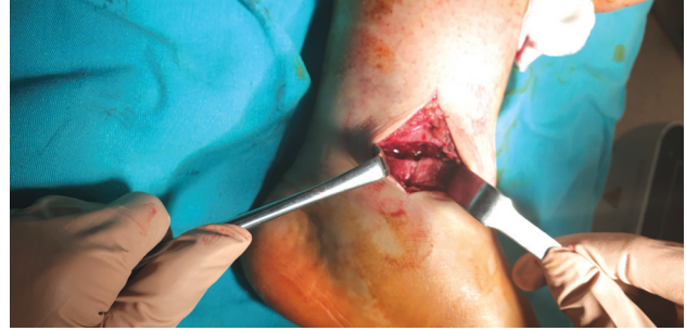
Fig. 7 19 year-old female with a left bimalleolar fracture, diagnosed as Weber Type 3

(Coraspin® 100 mg 30 tabs, Bayer) 3 days before. On the first postoperative day, there were ecchymosis and swelling in the shoulder area of the patient. On the third day, ecchymosis and swelling subsided (Fig. 10).