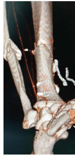
Fig. 2 CTA shows an unclear perforation