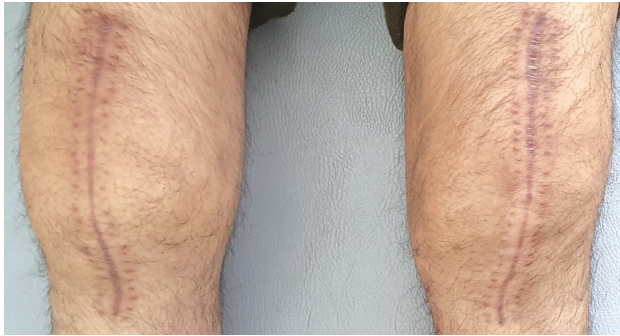
Fig. 6 Bilateral total knee replacements in a 36-year-old haemophilia patient

Group 3 (ITP) A 19 year-old female was brought to our trauma service with a left bimalleolar fracture sustained in a traffic accident, diagnosed as Weber Type 3 (Fig. 7). Patient anamnesis revealed a disease-free status, except her isolated thrombocytopenia was 80,000/ml. After a second review, her PLT count was 77,000/ml. The patient was operated on with two cannulated screws for a medial malleolar fracture and a plate with screws for a fibular fracture. On the second postoperative day, isolated thrombocytopenia was 47,000/ml, and ecchymosis and swelling were observed at the site of the intervention (Fig. 8). The patient was controlled for postoperative bleeding and compartment syndrome for seven days. Medication was applied internally. At clinical follow-up, the patient's extremity had returned to normal.