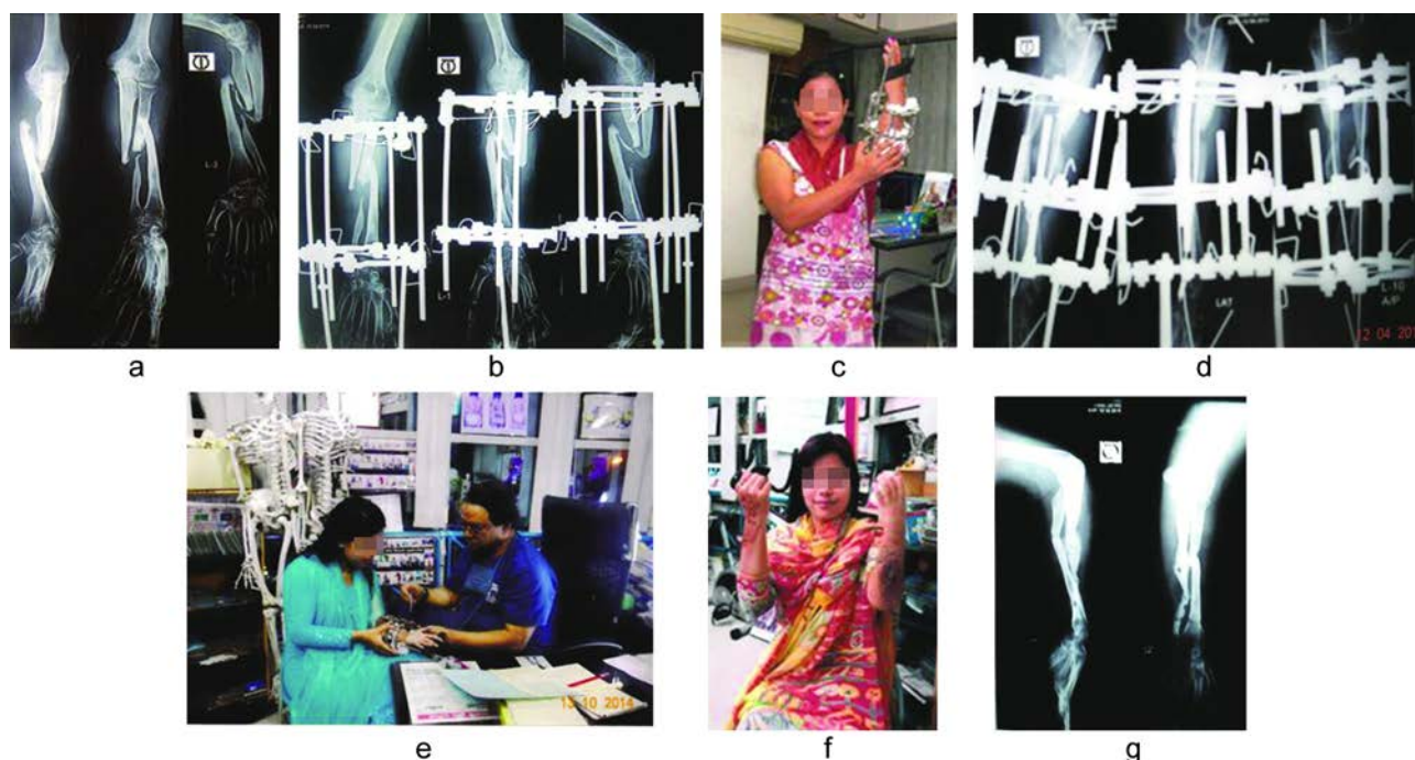
Fig. 1 a 6-year old atrophic non-union of both radius and ulna (left side); b distraction with two rings for release of soft tissue contractures; c clinical appearance of the patient with the Ilizarov fixator on the left forearm; d distraction osteogenesis by the Ilizarov technique; e regular follow-up of the patient; f clinical appearance of the patient after 9 months with good hand function; g final radiograph of both radius and ulna with full consolidation after 9 months

Patients resumed ADLs (activity of daily living) 12 days after surgery with the Ilizarov apparatus.