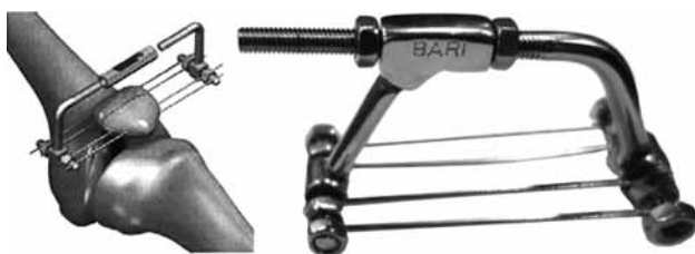
Fig. 1. Compressive External Fixator

After 1st operative day it is necessary to clean the wire sites with rectified spirit or any kind of antiseptic solution. All the patients were advised to do physical therapy to increase the range of motion. Full range of motion is allowed along with full weight bearing as tolerated by the patient. Sound union was achieved and that was confirmed by X-ray. After 6 to 8 weeks the device was removed.